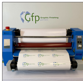
Machine can be used on a table-top without stand.