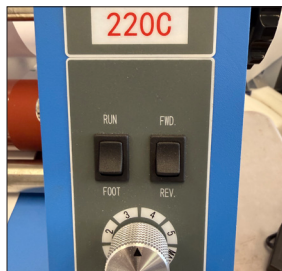
Simple controls: forward/reverse, run or foot pedal operation, and variable speed.

Easy setup and low maintenance make it a great fit for first-time laminator users while professional-quality results keep customers coming back.